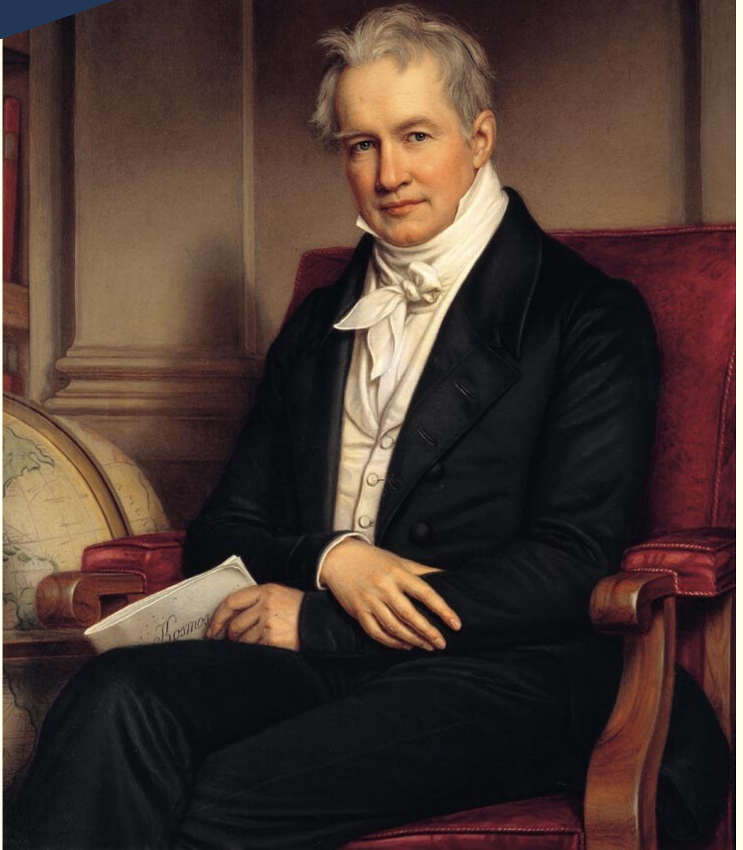
THE GERMAN EXPLORE AND NATURALIST ALEXANDER VON HUMBOLDT (1769-1859)