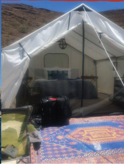
Our “tent” had a fan for the few hours of heat during the middle of the day.