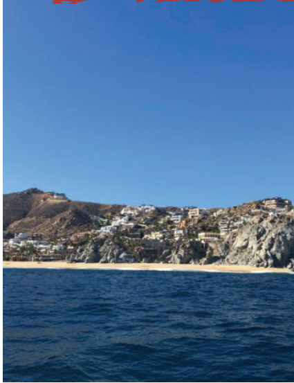
Fine Terre – the end of the world at the tip of the peninsula on the Pacific side.